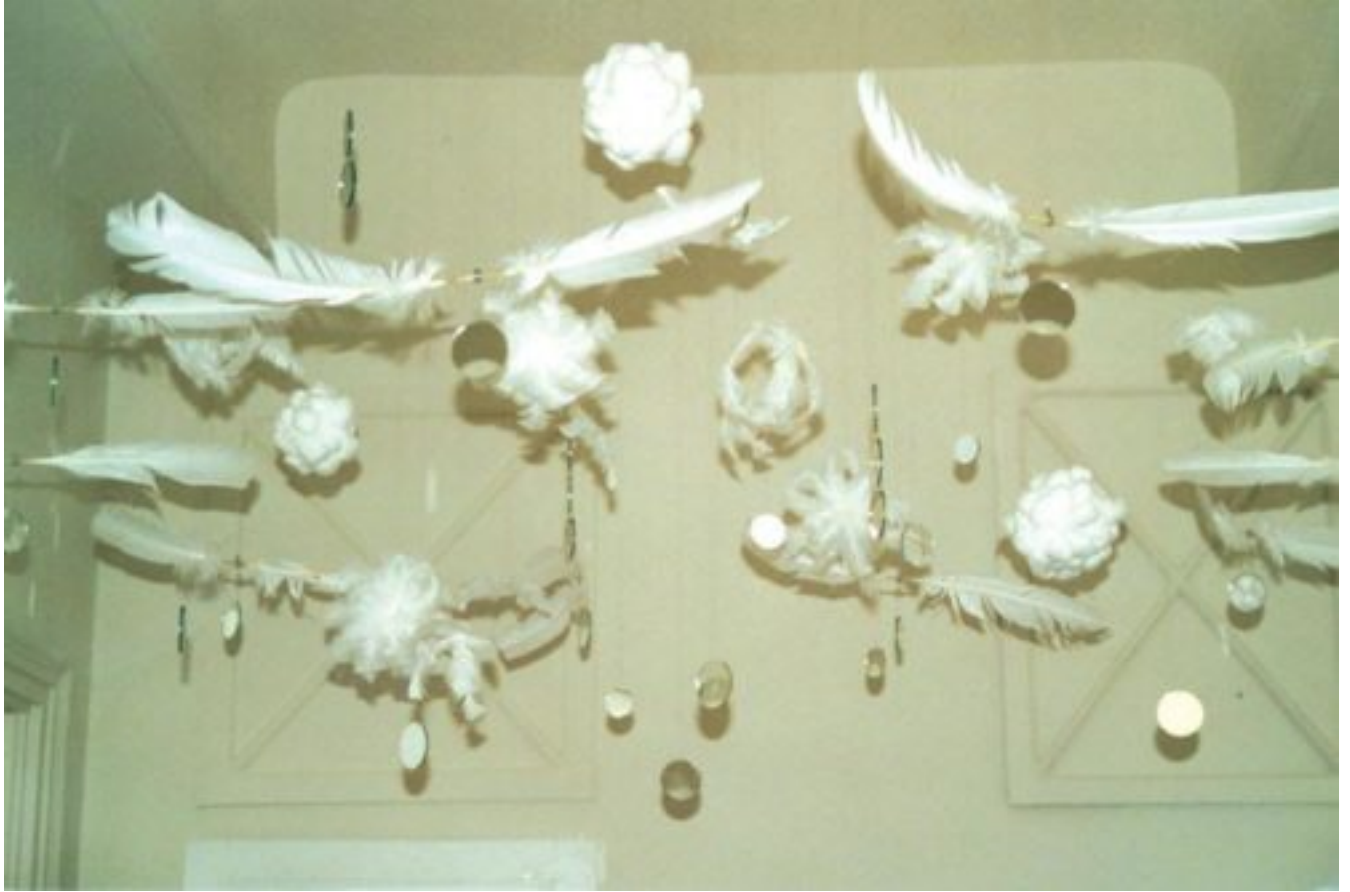
Installation "Dream Catcher" by Virginie Sommet