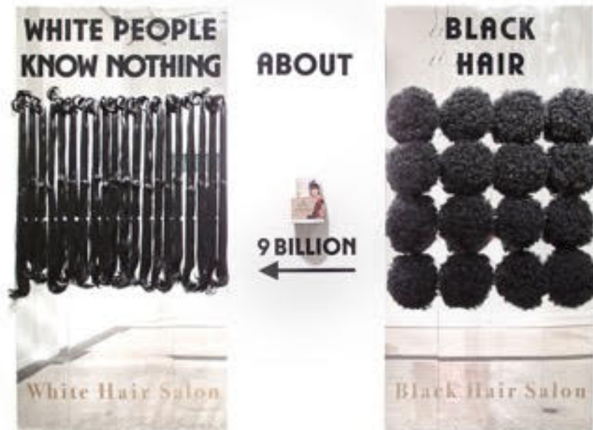
This 16 mirror installation is 8 feet high and 11 feet long

Stick to what you really like to do. Be stubborn in it, do not listen to too many opinions and you will succeed.