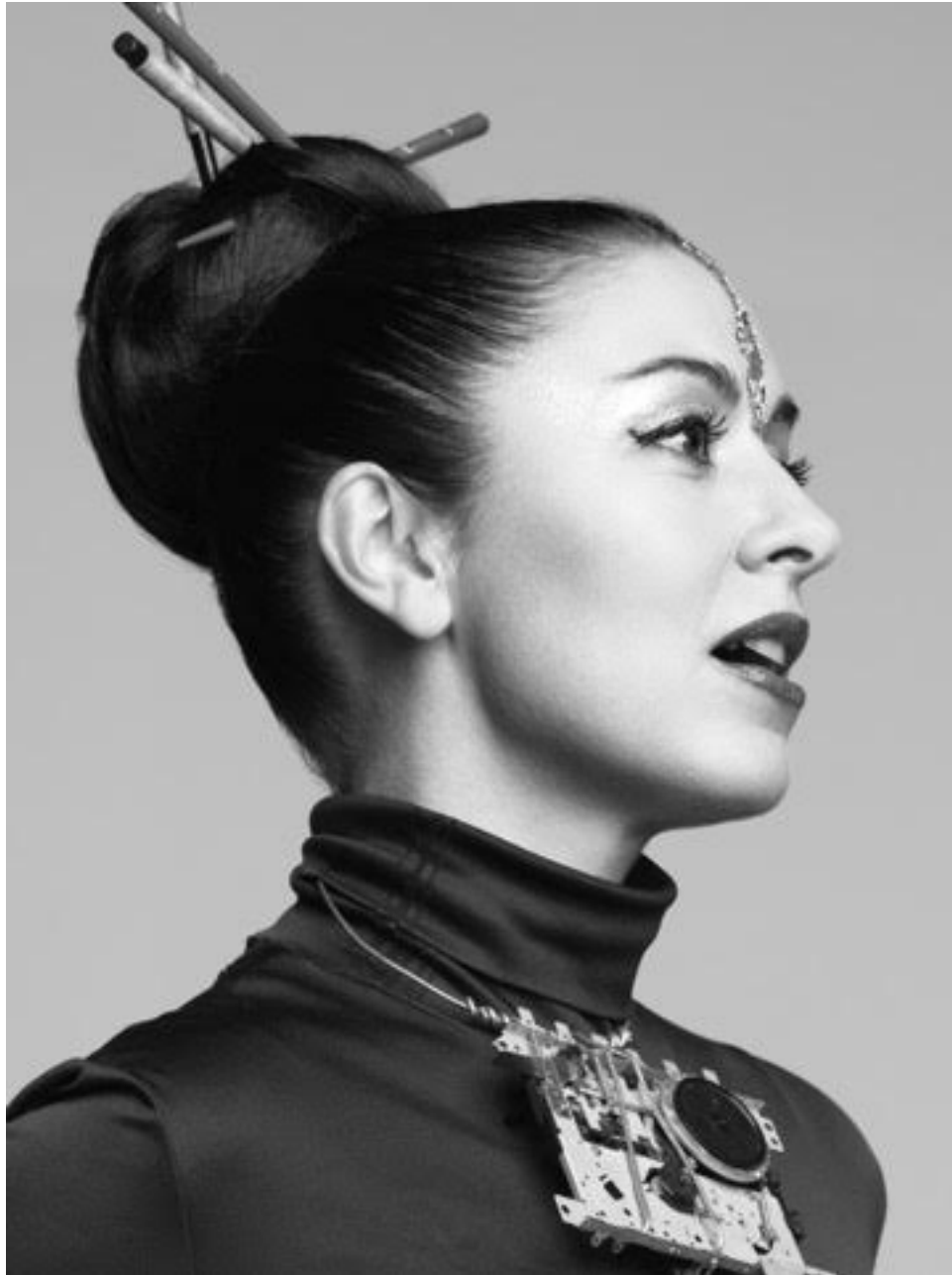
for the campaign "Power People" to inspire the Japanese population to rebuild after the Tsunami.